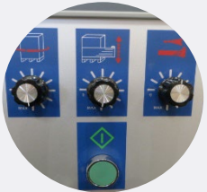
Independent dial controls for • Turtable speed • Carriage speed • Pre-stretch motor