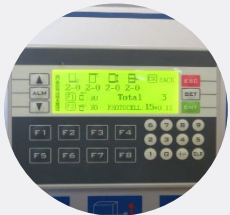
PLC control with 5 program memory