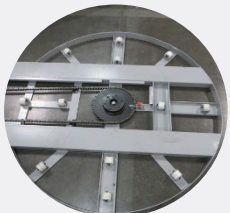
12 load bearing roller supports