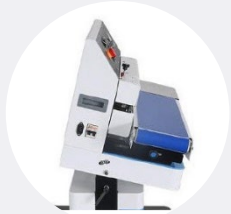
Tilting seal head – up to 30 degrees