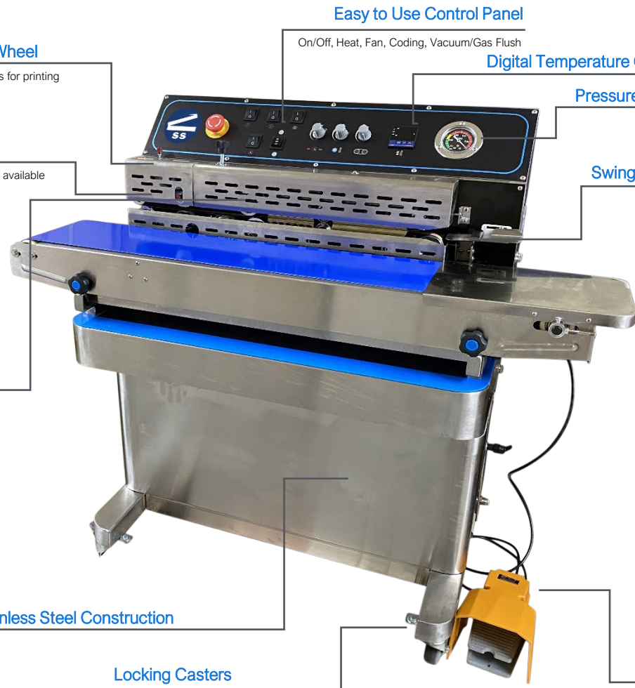
Easy to Use Control Panel

On/Off, Heat, Fan, Coding, Vacuum/Gas Flush