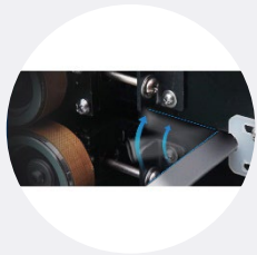
Swing Nozzle for Vacuum or Gas Flush