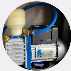
1/3 HP Vacuum Pump