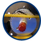
Printing Wheel Holds typesets for printing