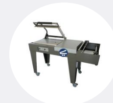
SS-1519L No Magnet Hold No Power Discharge Conveyor