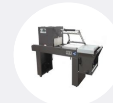
SS-1519LMC Combo Machine w/ Shrink Tunnel