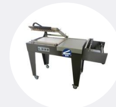
SS-1519LM Magnet Hold Down No Power Discharge