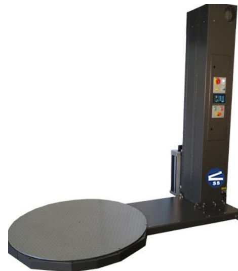
SPW-982HP High Profile Does not include ramp