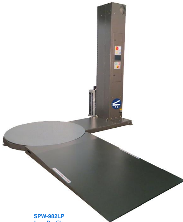
SPW-982LP Low Profile

Utilizing 20" machine stretch film, the mechanical brake stretch provides for increased film yields up to 150%