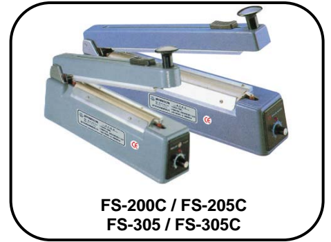
FS-200C / FS-205C FS-305 / FS-305C

FS-Series Hand Sealers are compatible with the TISH-Series hand sealers.